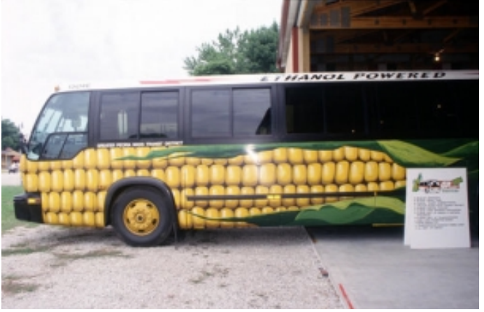
This bus uses ethanol instead of gasoline as a fuel.

can be deadly poisons, especially in the amounts used to make transportation fuels. Methanol is especially toxic. Even small amounts breathed in as fumes or accidentally swallowed can cause blindness, severe liver damage, and death.