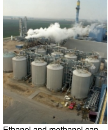
Ethanol and methanol can be made from plant materials such as corn, at refineries like this one.

Both ethanol and methanol make excellent fuels for cars and trucks. In fact, ethanol is used in the engines of Formula 1 racing cars. It burns very cleanly, and delivers more power than gasoline. Many service stations now sell fuels that contain a blend of gasoline and an alcohol, usually ethanol.