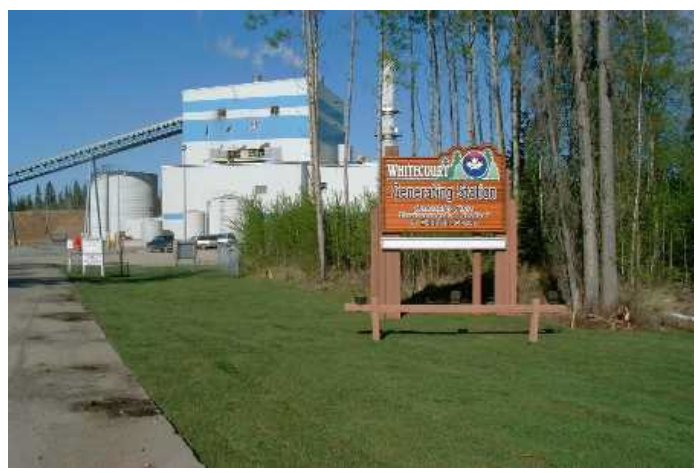
This generating station in Canada burns biomass fuel from nearby sawmills to produce energy.

from sugars, which they make during photosynthesis. Because cellulose is made from sugar, it contains a lot of stored chemical energy, energy that originally came from the sun. This chemical energy can be released as heat when wood is burned.