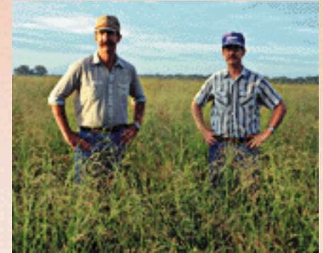
Switchgrass could be a new crop for farmers.

Opportunities for biomass energy are growing. For example, several million dollars of federal incentives are available through the 2002 Farm Bill to develop advanced technologies and crops to produce energy, chemicals, and other products from biomass. A number of states also provide incentives for biomass energy.